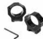
< TORCH MOUNT K7010018001