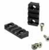
WEAVER MOUNT > K7010016001