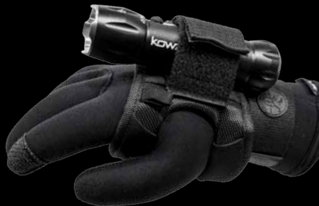
WRIST STRAP K7010007001