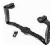
< CAM FRAME K701001901

The ergonomic handle allows you to securely hold the torch and allows for perfect balance. Modular, innovative mounting system! (suitable for cameras with 1/4" thread).